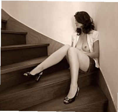
To the corner (black and white) Maybe she was punished?