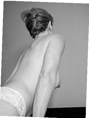
Inclined toward the wall (black and white)I should try to be a wall sometimes