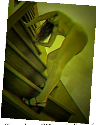
Sisyphus 3D painting (colour anaglyph) The red/cyan conversion gave a greenish look to this photo